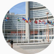
United Nations Vienna

The lectures will be held at these venues: